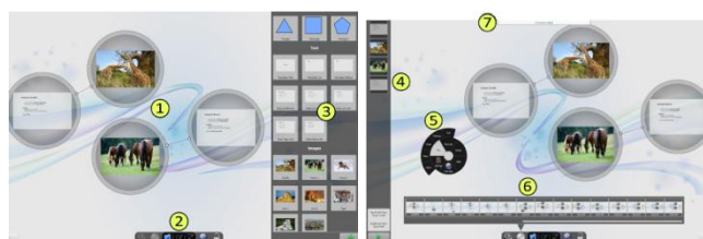
Figure 1. Overview composition mode: (1) information clouds, (2) menu to switch mode, open timeline, etc., (3) elements and templates that can be added to the canvas. Overview presentation mode: (4) snapshots determine predefined path, (5) pie menu, (6) timeline of actual path that was followed, (7) feedback on user’s actions.

In presentation mode, features such as adding content and connections are disabled, and a simple gestural interface allows the presenter to control the presentation. However, the presenter can switch between modes at any time during a presentation, should on-the-fly editing be required (Figure 1-2). Changing the presentation while presenting it is still very much unexplored and requires specific editing techniques. We imagine these techniques to be similar to the ones used during brainstorming. In our current prototype, we did not yet evaluate this feature to a great extent, but mainly provided the infrastructure to enable on-the-fly editing of the presentation. More details on the presentation mode and gestural interface are discussed in 2.3.